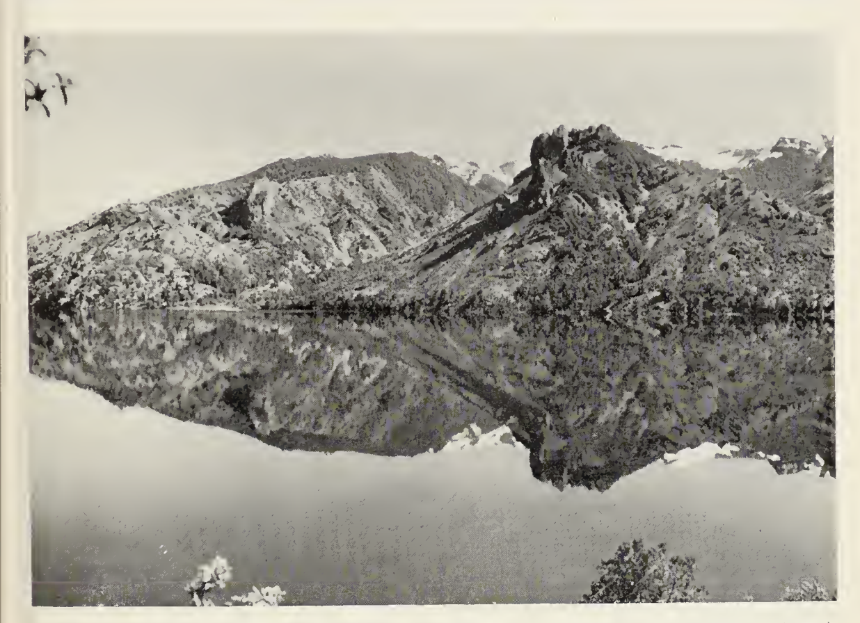
FIG. 4. Cutover Nothojagus forest (lower slopes) and mature forest (upper slopes) above Lake Meliquina, about 25 kilometers south of San Martín de los Andes, Neuquén. Magellanic Woodpeckers occupy mature forest, and, sporadically, patches of cutover forest.

rapidly while feeding, moving often from tree to tree. The wings of these woodpeckers produce a flapping sound as the birds fly from tree to tree. The white in their wings (pattern described below) is also very obvious while they are in flight.